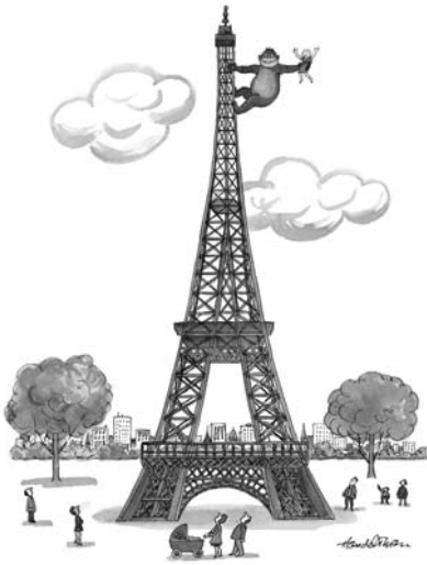
Le Roi Kong

others may be quite distant, merely superficial, even purely coincidental. In fact, the majority of French words that resemble English words differ in meaning. “An injury” is a wound, for instance, but une injure is an insult. The French verb prétendre refers to making a claim or an assertion, not indulging in make-believe. (The English words “pretense” and “pretentious” are closer to the French original; a pretender to the throne is one who lays a claim, not someone who’s play-acting.) The patron of an establishment is its owner, never its customer. The verb demander is used to make a simple request, not just issue an ultimatum. Your anniversaire falls on the date of your birth, not the date of your marriage. And so on and so forth.